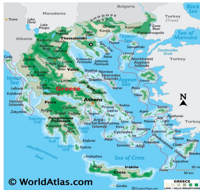
Map of Greece